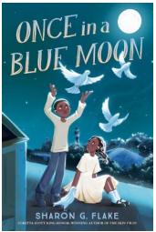
Once in a Blue Moon By: Sharon G. Flake