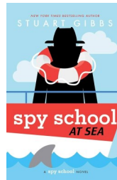
Spy School at Sea By: Stuart Gibbs