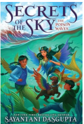
Secrets of the Sky: The Poison Waves By: Sayantani Dasgupta